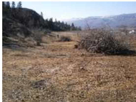
Whistler Canyon improvement